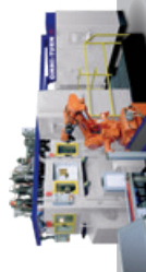
MILL-TURN MULTI-SPINDLE MACHINES