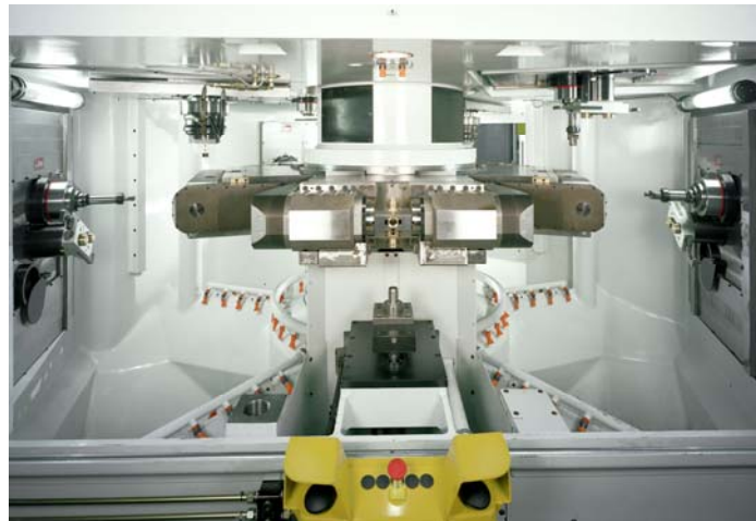
TRANSFER MACHINE FROM BAR WITH COLLETS AND CHUCKS TRANS-BAR-COLLET

4-5 AXIS FLEXIBLE TRANSFER MACHINE WITH CONTINUOUS INDEXING CHUCKS AND ELECTRO-SPINDLE MACHINING CENTER MODULES COMPLETE WITH TOOL CHANGE TRANS-N-CENTER MAXI