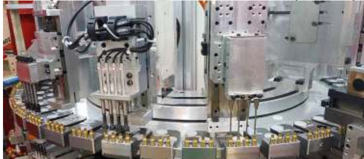
Flexible CNC machine, any cam driven units, just CNC.

Strong and stable machine frame automatically loaded by centrifugal feeders, can unload the ammunition directly in the tray.