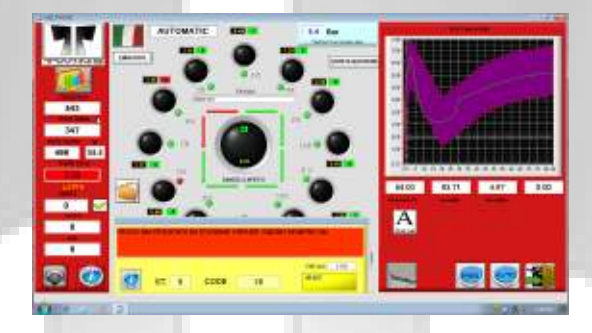
100% Electronic con

All the machine faults are immediately displayed on the monitor with a clear description and a picture or a sketch that show the area of the machine where the fault happened.