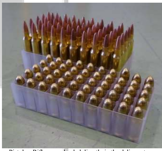
Pistol or Rifle are unloaded directly in the delivery tray.

The working sequence can be programmed directly in the machine CNC, including also manually operations driven by the CNC. The working time of the units can be also programmed as a part of the sequence. All the production data are continuously saved in the machine memory or directly in your network, in order to allow a real time process traceability and statistic analysis. The working time and the stop or setup time are also saved in order to allow an efficiency survey, much more than a simple OEE. Calibration data are stored too, in a separate file and managed from a dedicated scheduler.