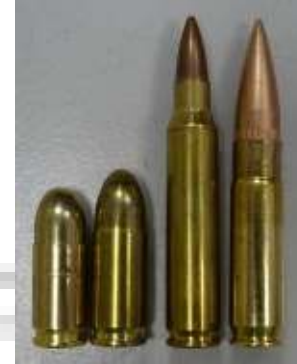
9Luger 380Auto, 223, 300AAC calibers in the same machine, with quick change over.